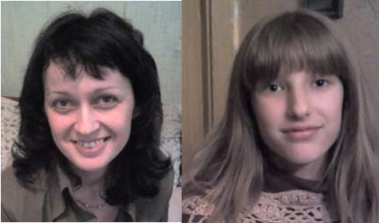
New Ukrainian Believers - FRUIT in '06